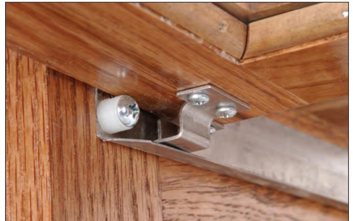
Left capture bracket shown mounted with the door open.