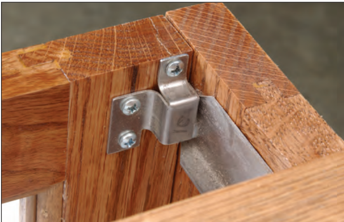
Left capture bracket shown mounted with the door closed.

* All screws 3, 6 and 7 are to be mounted 1" down from top edge of cabinet.